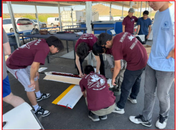
Your payload is what, exactly? Oh, and hockey pucks too!