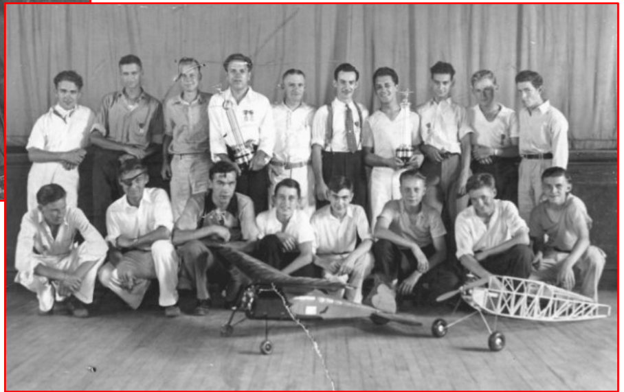
More vintage fun from MAN v1:2 August 1929