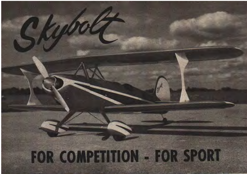
Left: Ad from Model Aviation 1975

I guess we have to thank Sig Mfg. for still making model airplanes we love to fly.